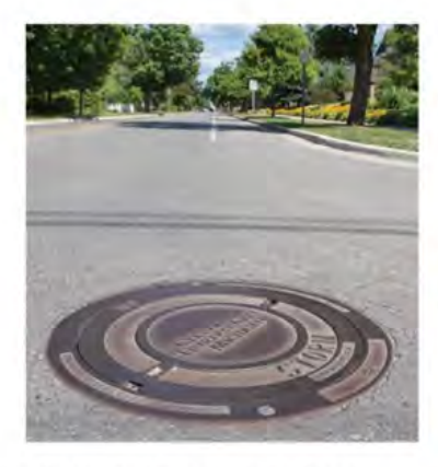
SELFLEVEL assembly floats with the roadway, keeping the surface smooth during settling and frost heave.

Improve driveability while reducing road maintenance, inflow, and infiltration. Available for asphalt and concrete applications.