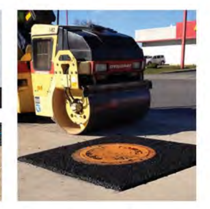
An excellent solution for new or retrofit installations.

Visit r.ejco.com/lunch to request a lunch and learn demo or call 800 626 4653. Made in the USA